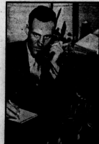
Clyde Tolson, Assistant Director, Division of Investigation, receives information regarding a kidnaping case.