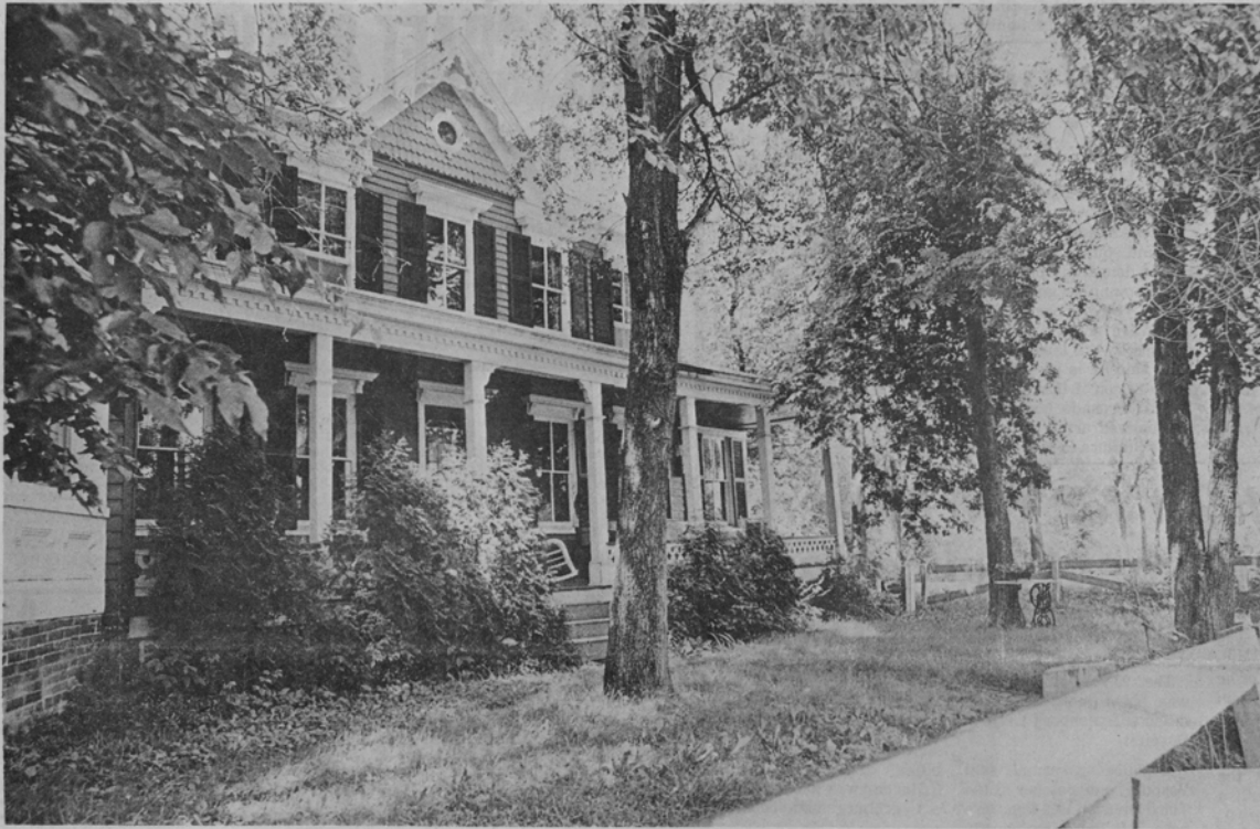
Bristow Road House