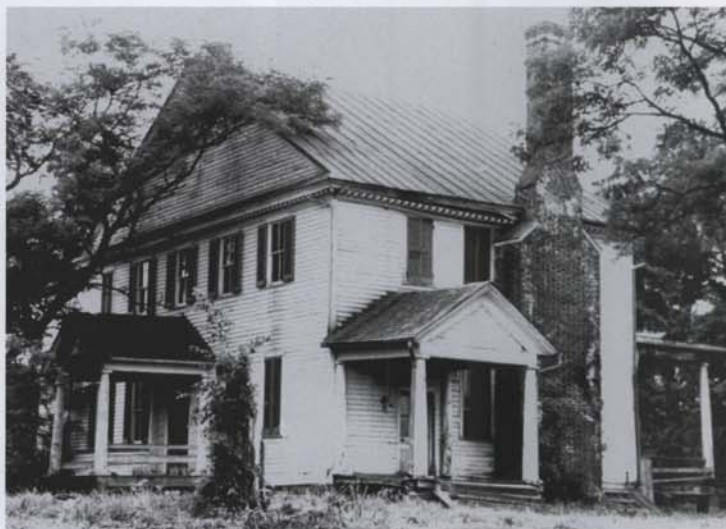
Western exposure of Cloverland, with side and rear porches and the massive brick chimney.