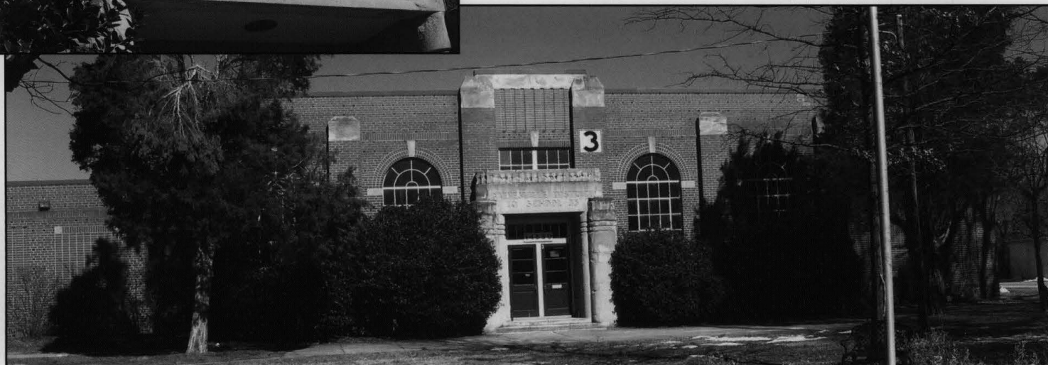
Located on Rt. 55 east of Haymarket, Gainesville Elementary School was opened in 1935, and expanded several times. It now serves as the PACE West School. Inset: Entablature above the front entrance to the old Gainesville Elementary School includes the date of its opening, 1935.