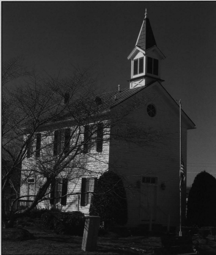
Originally built in 1884 as a combination town hall/schoolhouse, this building on Washington Street now houses the Haymarket Museum.