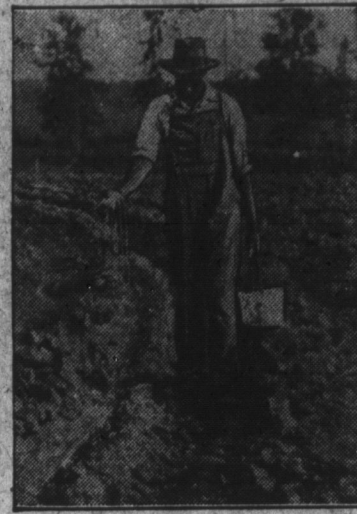
Side-dressing cotton on Moss farm, Soso, Miss.