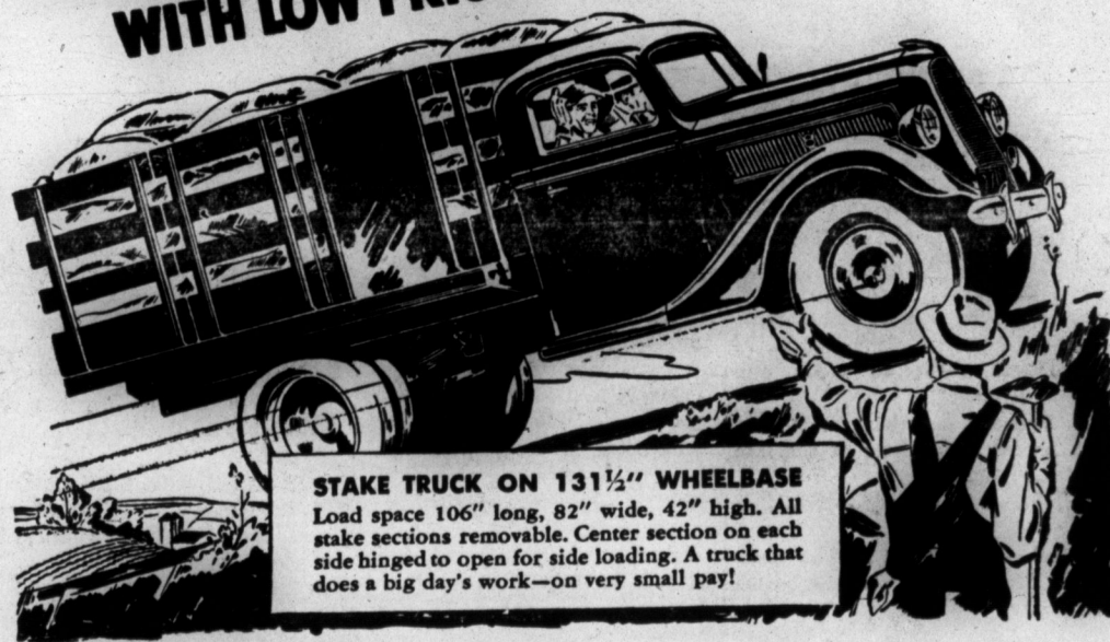
STAKE TRUCK ON 131 1/2" WHEELBASE Load space 106" long, 82" wide, 42" high. All stake sections removable. Center section on each side hinged to open for side loading. A truck that does a big day's work—on very small pay!

Big-Job POWER- WITH LOW PRICES • LOW UPKEEP TOO!