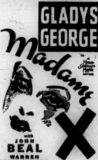
JOHN BEAL WARREN WILLIAM Reginald OWEN William HENRY

FOR 1 RECKLESS HOUR... THE WORLD MADE HER PAY!