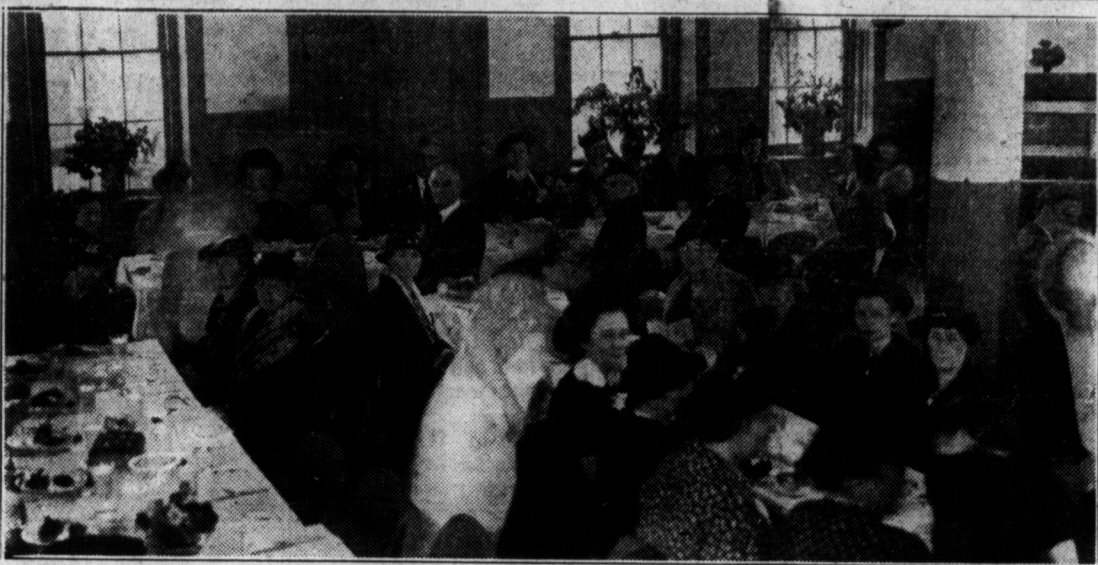
Home Demonstration Club-women Dine at old Brentsville Court House —(Photo by Cooper).