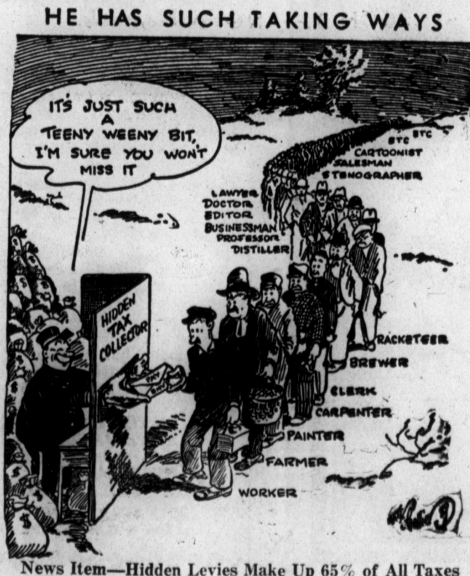
News Item—Hidden Levies Make Up 65% of All Taxes