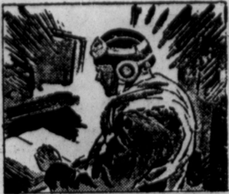
2. Radio combines the voice and the ears of the plane, allowing communication between the pilot and his squadron, and the ground and sea forces.