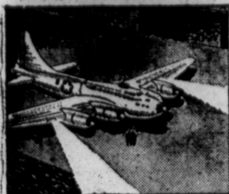
1. Lamps are the eyes of the plane at night, ranging in size from cockpit lamps no larger than a pea to landing lamps of more than half-a-million candlepower.

Electricity helps make America's war planes some of the world's most deadly weapons. Here are a few of the ways in which G-E equipment serves in the air.