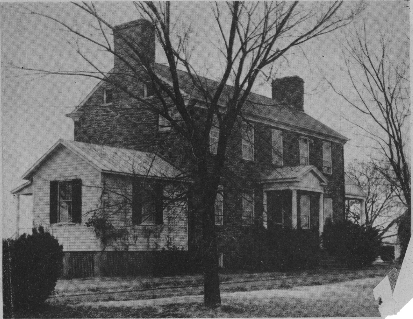
THE HISTORIC BEN LOMOND FARMHOUSE

MANASSAS, VA., THURSDAY, FEBRUARY 29, 1968