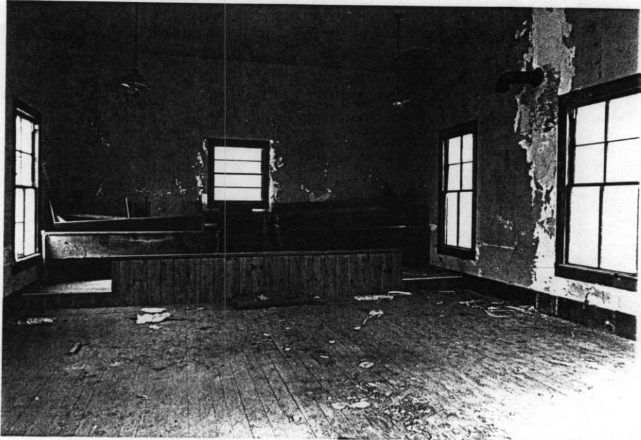
MAY 1980 REAR WALL (INTERIOR)