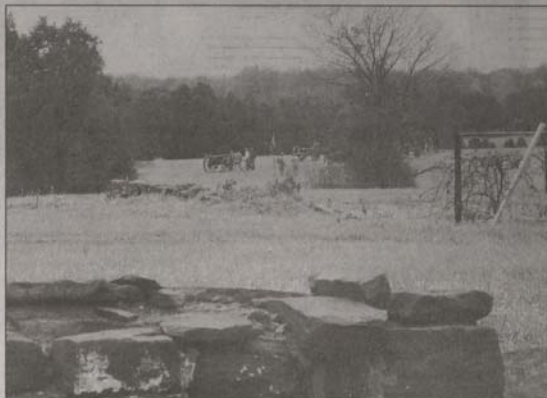
Bristoe Station in Bristow was the site of major Civil War activity, beginning with the Battle of Kettle Run. Prince William County's Historic Preservation Division will conduct interpretative tours on Saturday, the anniversary of the battle.

Q: What might attract people who aren't necessarily interested in history to the park?