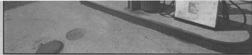
The Buckhall General Store on Moore Drive outside Manassas brings new owners under its spell.