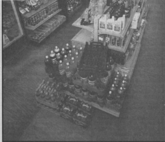
The Buckhall General Store offers a wide assortment of items.