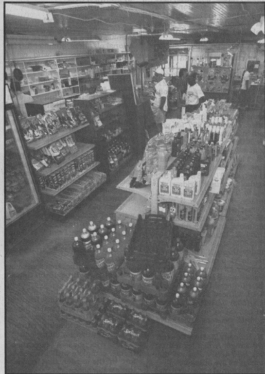
The Buckhall General Store offers a wide assortment of items.