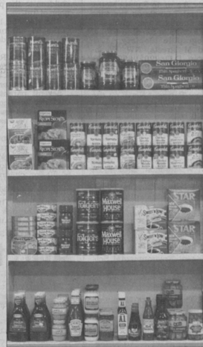
Although the store is more than 100 years old, the new owners discontinued buggy whips and feed for more modern fare.