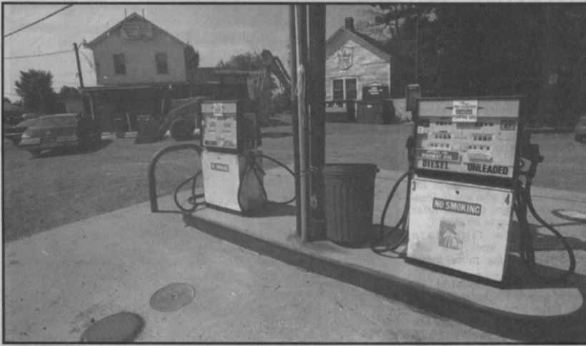
The Buckhall General Store on Moore Drive outside Manassas brings new owners under its spell.