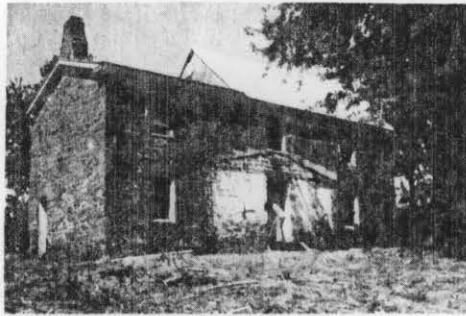
Bloom's farmhouse as it appeared in mid-1976. The porch is long gone and a frame kitchen wing on the back was recently demolished.

"Bloom's Grove" appears to have contained the same acreage during its operation as a farm. The earliest known deed reference, that of August 16, 1843, when