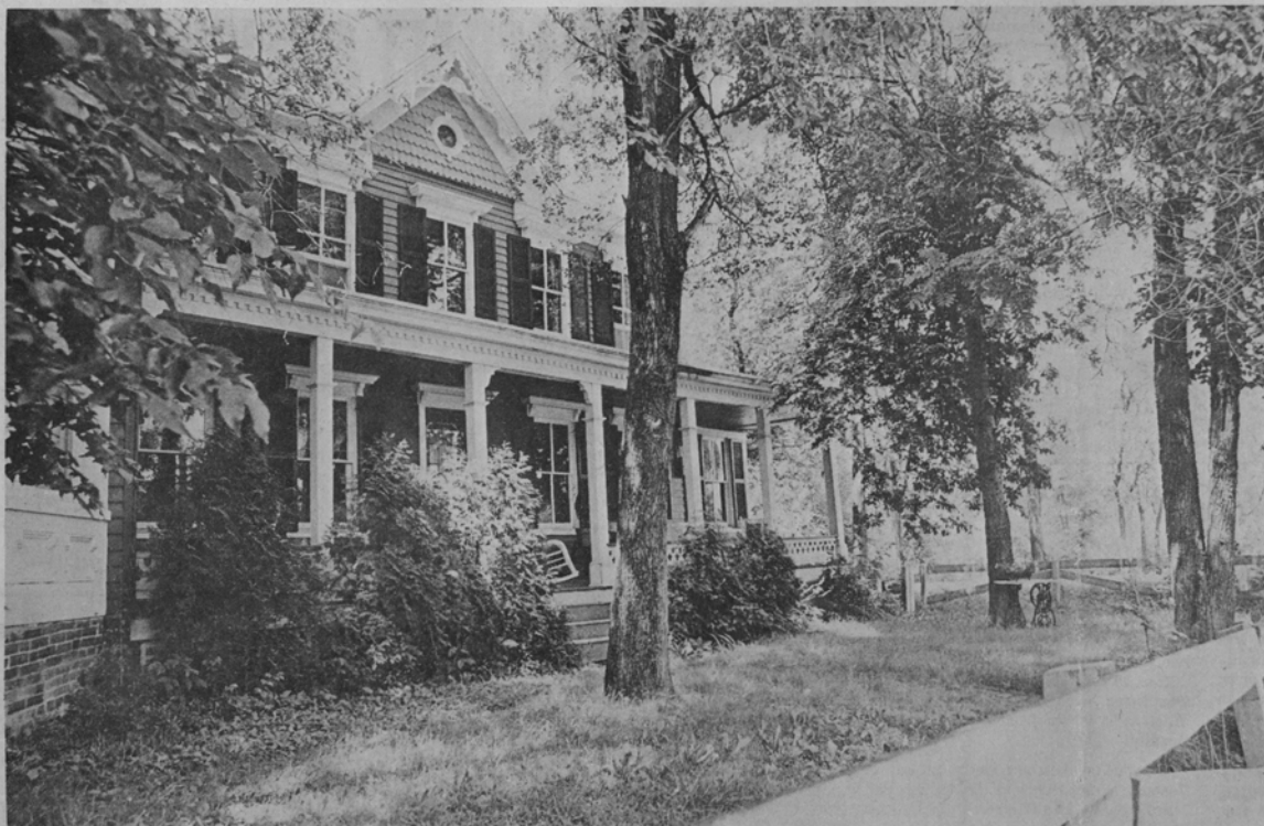
Bristow Road House

The early Victorian house, built in 1818, houses the Beard family, the White Elephant Antique Shop, and The Pi-Billed Grebe.