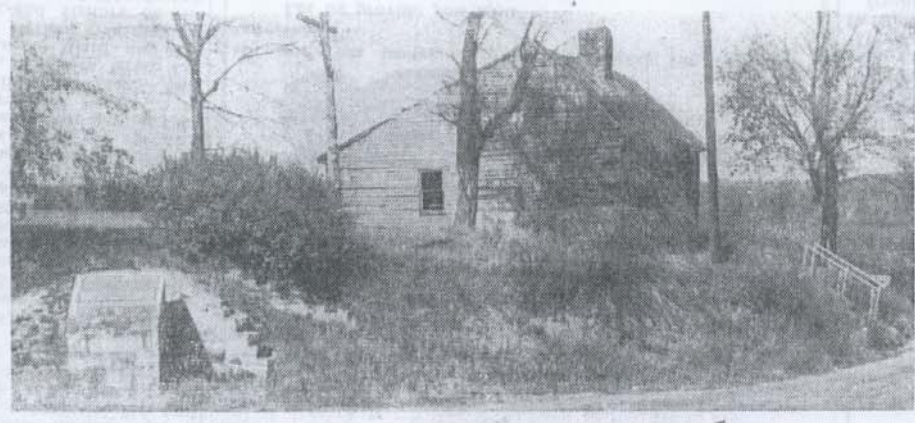
THE "DOGAN HOUSE," HISTORIC LANDMARK, TO BE ADDED TO BATTLEFIELD PARK