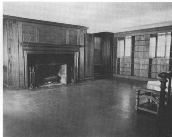
Richly paneled Library with an abundance of windows show off the 36 inch stone walls. A separate stairway leads to the upper floors.