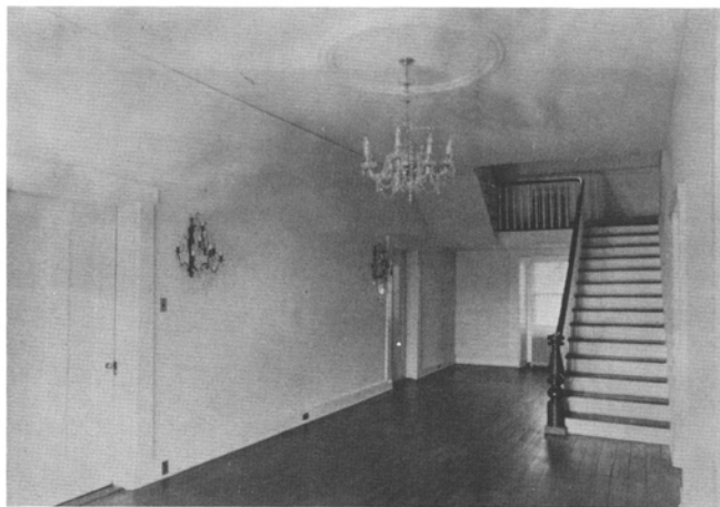
Crystal chandelier and wall sconces grace the first floor Entrance Hall leading to twin drawing rooms and to master bedroom suite.

PRICE: $448,000 ADDITIONAL ACREAGE AVAILABLE