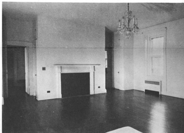
The Master Bedroom suite is complete with spacious bathroom, separate dressing room, ample closets and fireplace.