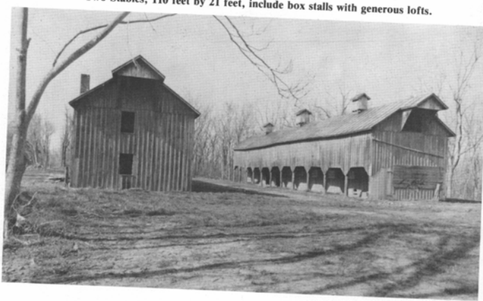
Two Stables, 110 feet by 21 feet, include box stalls with generous lofts.