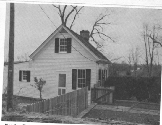
Nearby Cottage is ideal for housekeeper's quarters or as professional offices.

VIRGINIANA FILE JUL 16 1981 PLC - Historic Buildings (Falkland)