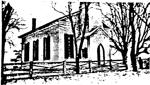
Our Church had a fence. (Picture taken in 1945)

VOL. 93. NO. 33 Single Copy 10c MANASSAS, VA., THURSDAY.