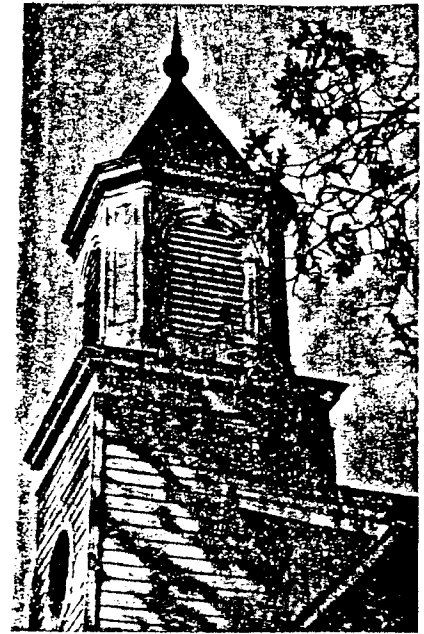
GAINESVILLE METHODIST CHURCH