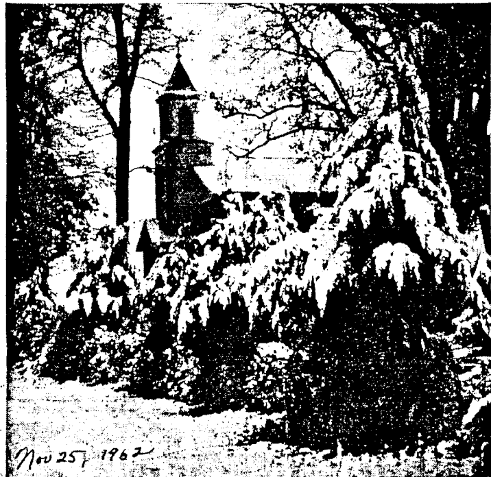
COUNTRY CHURCH AT THANKSGIVING TIME — The season's first snowfall Monday forms a picturesque scene with the Gainesville Methodist

VOL. 93. NO. 33 Single Copy 10c MANASSAS, VA., THURSDAY.