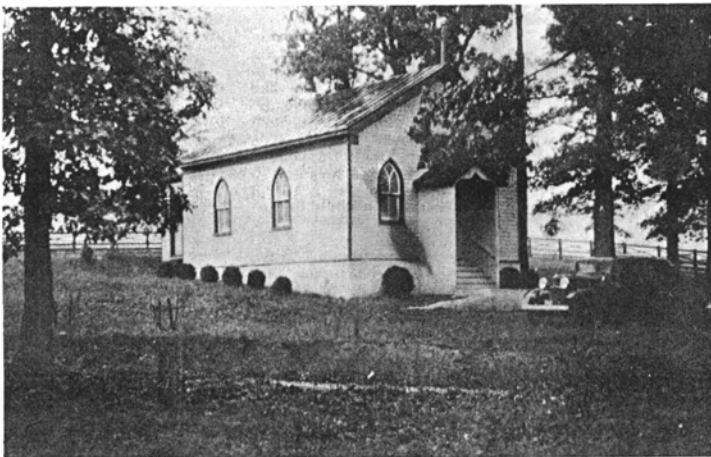
Grace Chapel when it was in use. The age of the photograph can be gauged by the size of the boxwoods, and by the fenders and running boards on the car.

VIRGINIANA FILE Pg 6 - Historic Sites (Grace Chapel)