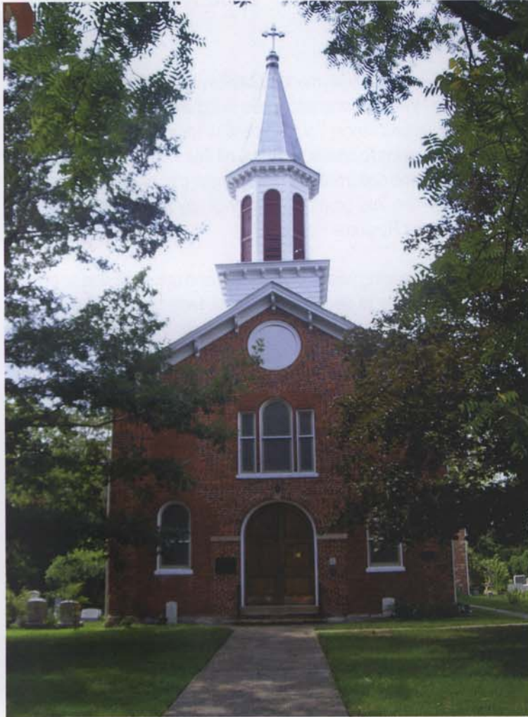
St. Paul's Episcopal Church, consecrated in 1833, was completed in 1803 as the Superior District Courthouse, serving Prince William, Fauquier, Fairfax and Loudoun counties.