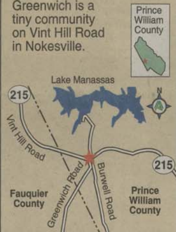
Times Newspapers Graphic/Damie Malone Source: Rand McNally

Greenwich is a tiny community on Vint Hill Road in Nokesville.