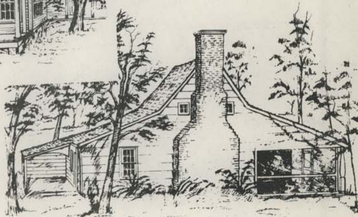
The McCormick House - 1802