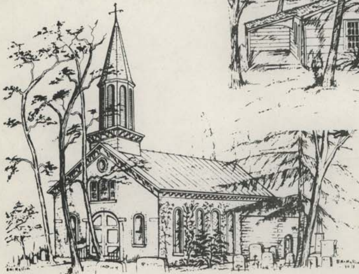
Saint Paul's Episcopal Church - 1803