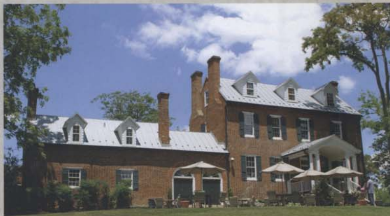
Manor House, Winery at La Grange

The Winery at La Grange celebrates an abundance of history, award winning wines and playful ghosts at their upcoming four-year anniversary. Inviting guests to a unique getaway near the Blue Ridge Mountains since September of 2006, historic La Grange is a 20-acre farm winery that produces, processes and bottles their own wine. Origins trace back to the 1600's provide that La Grange has been a desired tract of land for four centuries and since 1790 entertaining visitors in the charming three-story Manor House. Blessed with captivating individuals for hundreds of years, some of the wineries most frequent visitors are its ghosts.