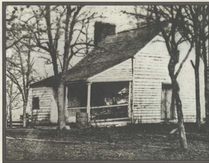
James Robinson House

Many of these Unionists left their homes because of the escalated tension in the local communities. One resident of Vienna observed that the fear of violence among Union sympathizers in the area "had destroyed the confidence between friends and neighbors... Thirty four families left Vienna in two days with what they could hastily gather up." Others