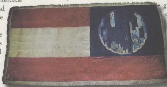
10 th Virginia Infantry Battle Flag