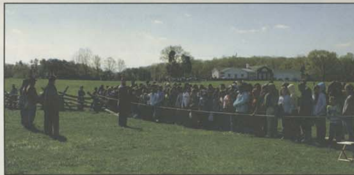
Students from Stonewall Middle School listen to living history volunteers during a recent visit to the park.

ply because its namesake won his nickname on acreage preserved within the park, but because of the diverse composition of its student body. A few of the vodcasts will use Spanish to help English as a Second Language students better relate to some of the human interest story lines to be found for all modern Americans studying the American Civil War era. When completed in the spring of 2011; in time for the sesquicentennial of the First Battle of Manassas, these vodcasts will provide fresh perspectives upon the significant historical events and themes interpreted at Manassas National Battlefield Park.