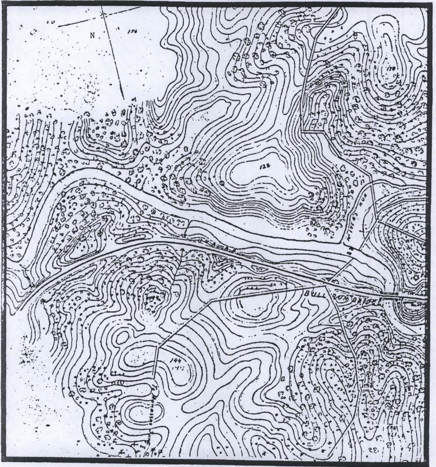
Figure 1. 1862 Topographic Map (Whiting/McComb)